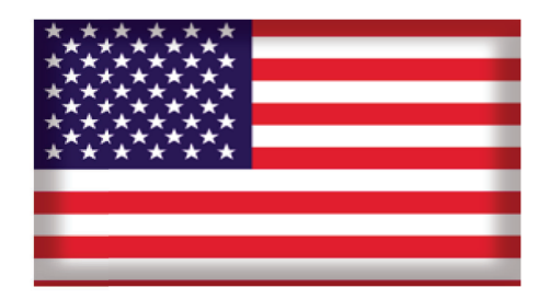
Proudly Made in the U.S.A.